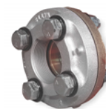
2-1/2" - 3"